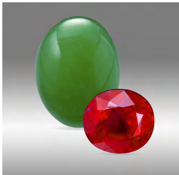
Figure 5. The Tom Lantos Block Burmese JADE Act, an act of Congress signed in 2008, banned ruby and jadeite imports from Myanmar into the United States.

Intergovernmental organizations are not the only actors on the ethical jewelry scene. Independent groups have formed to help ensure transparency and promote fair treatment of workers. The Responsible Jewellery Council (RJC), a third-party certification organization, goes a step further than the UNGPR. The RJC subjects its more than 700 voluntary member companies ("Members," n.d.) to additional standards that have been guided by the Compact and other sources, and then has those efforts audited by independent third parties. RJC members must receive certification within two years of joining, submit to voluntary third-party audits, and make ongoing efforts to improve their business practices ("FAQs: Membership & membership responsibilities," 2012). Certified members can then pursue Chain of Custody Certification, a framework that was inspired by the OECD's Due Diligence Guidance for Responsible Supply Chains of Minerals from Conflict-Affected and High-Risk Areas . Following this guidance indicates that all materials used are ethically produced along the entire supply chain—that they meet human rights, labor, environmental impact, and accepted business standards. Yet the RJC has faced criticism that loopholes in their system allow members to use jewelry materials that do not meet ethical