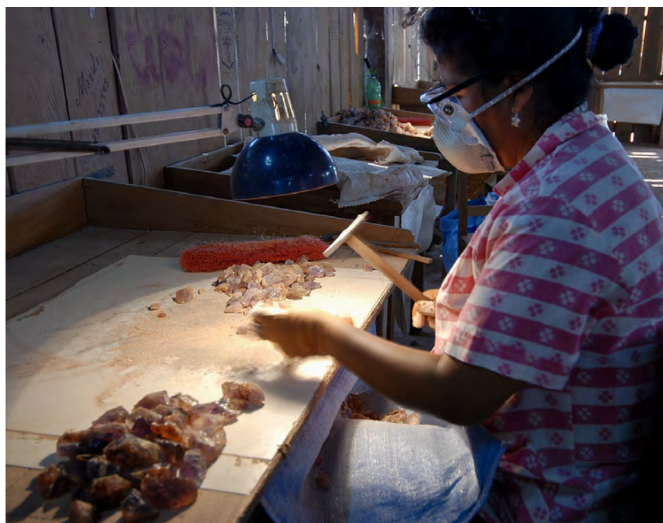
Figure 4. Copping and cutting gem materials without appropriate ventilation or safety gear, such as the surgical mask worn by this woman at the Anahí ametrine mine in Bolivia, can lead to silicosis and other respiratory illnesses.

tional Labor Committee, 2010). While silicosis is most closely associated with cutting, the disease may also be contracted by workers in underground mines, as with tanzanite miners in Merelani, Tanzania (Cartier, 2010). Headaches, impaired vision, and fatigue may also result from gemstone cutting; asphyxiation may even occur. Children in the workforce suffer orthopedic problems such as bone deformation, and skin conditions are another area of concern (World Vision, 2013).