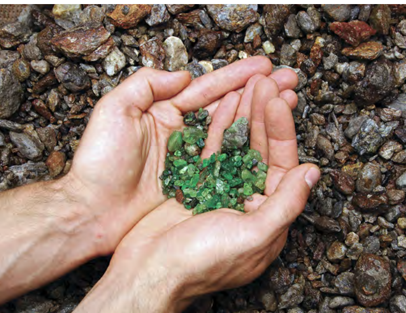
Figure 2. Alluvial mining often involves the retrieval, washing, and sorting of gem materials from gravels, as with this processed tsavorite from Lemshuko, Tanzania.

deposit (e.g. working in different tunnels), and sometimes sharing processing facilities (OECD, 2016c).