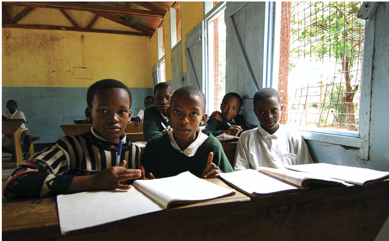
Figure 6. Children attend the school built in 2007 by Swala Gem Traders in Arusha, Tanzania.