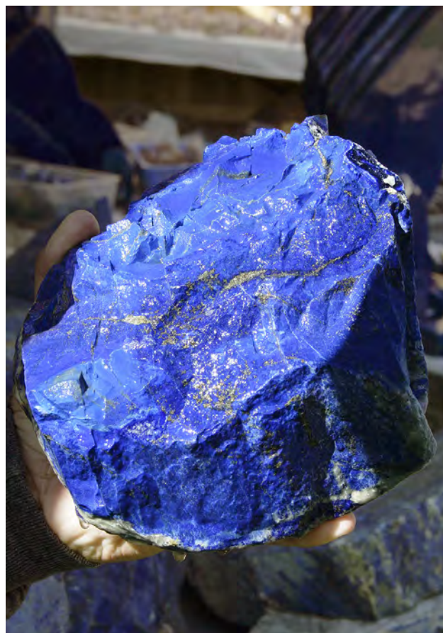
Figure 3. In June 2016, lapis lazuli from Afghanistan was named a conflict mineral by Global Witness.

The toll on human health does not end with gem extraction (figure 4). The Solidarity Center, a global labor organization, estimates that 80% of all colored stones in the market are processed in cutters' homes or in small shops (Connell, 2014). Eric Braunwart warned that "there are probably many more people dying in our industry from the cutting end than the mining end" (pers. comm, 2015). These workers frequently contract deadly lung diseases such as silicosis as a direct result of gem cutting. An estimated 30% of all gemstone grinders will die of silicosis (Na-